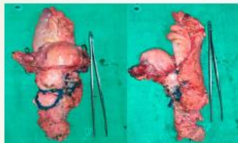
Posterior pelvic exenteration for recurrent CA cervix