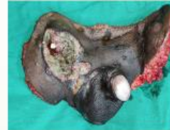
Total penoscrotectomy with bilateral ilioinguinal block dissection