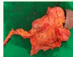
Left upper quadrant evisceration for CA stomach